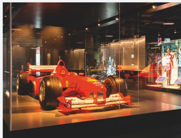
TOP: The 3-2-1 Qatar Olympic and Sports Museum ABOVE: Formula One car in the museum's Hall of Athletes