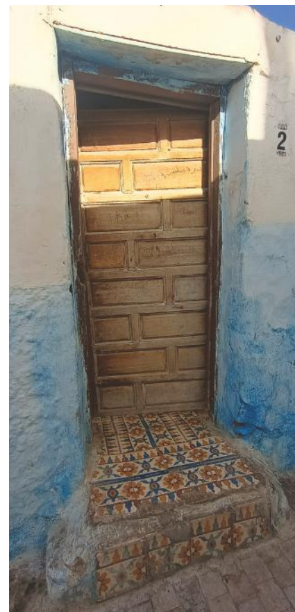
CLOCKWISE FROM ABOVE: Coastal ramparts, Rabat; fam trip group at Fairmont La Marina Rabat-Salé; Al Marsa restaurant; doorway in the city's medina

At Le Dhow, a boat moored on the Bou Regreg, we pile into seafood pastilla pies, fish tagines and a selection of salads as colourful as they are delicious. In the medina, we're led by lantern light to Dinarjat, where we tuck into mountains of couscous and koftas. And at Spanish waterside restaurant Al Marsa, in the swish marina, we demolish piles of seafood and paella.