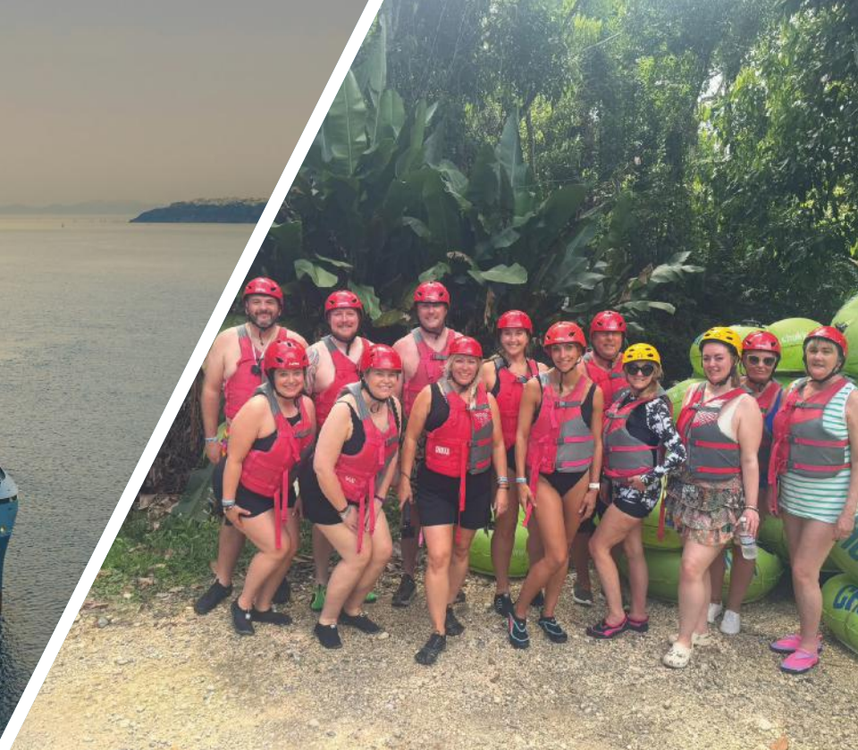
FROM LEFT: Resilient Lady ; the agent group gets set for tubing fun on Jamaica's White River