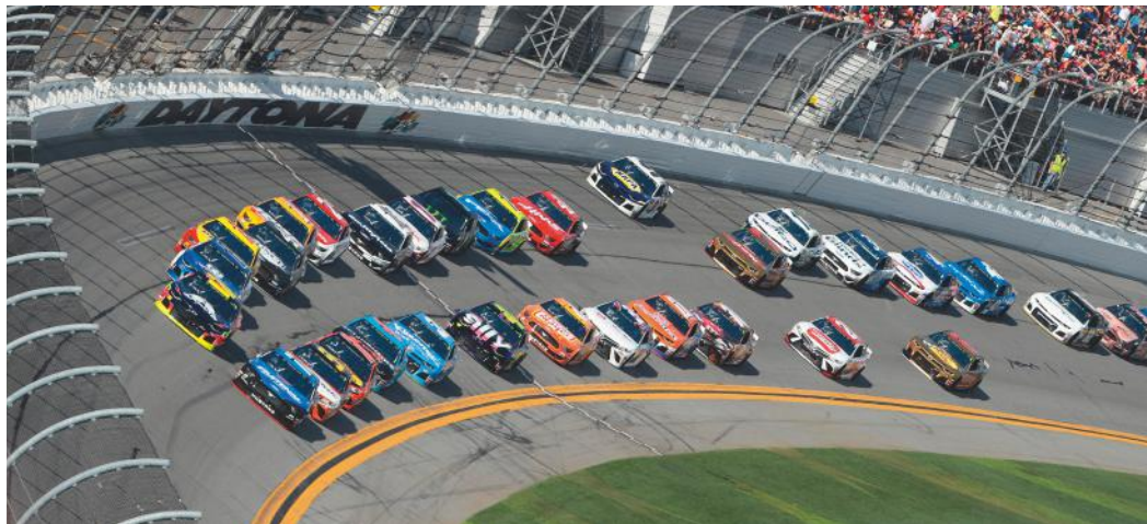
CLOCKWISE FROM LEFT: The Daytona 500, Florida; mountain biking in the Blue Ridge Mountains, Virginia; Lake Powell; Florida Keys