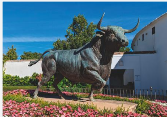
TOP: The Puente Nuevo bridge connects the old and new towns ABOVE: Ronda is home to one of Spain's oldest bullrings

A seven-night all-inclusive stay at Club Med Magna Marbella starts from £1,275 per person in November (based on double occupancy in a Superior Room). Price includes all food and drink, activities, transfers and return flights from Gatwick. A half-day excursion to Ronda costs from £92. clubmed.co.uk