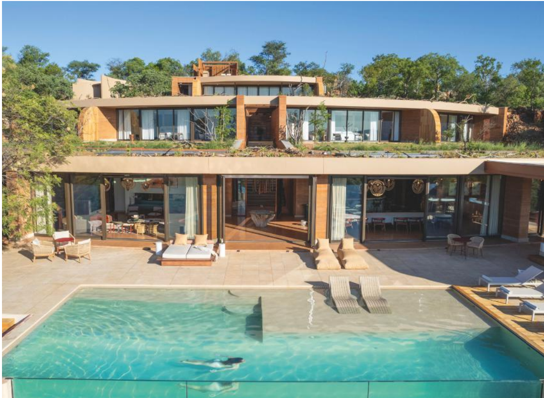
ABOVE: Melote House, Limpopo, South Africa BELOW RIGHT: Mara Toto Tree Camp, Kenya

let the romance of an African safari soar to new heights.