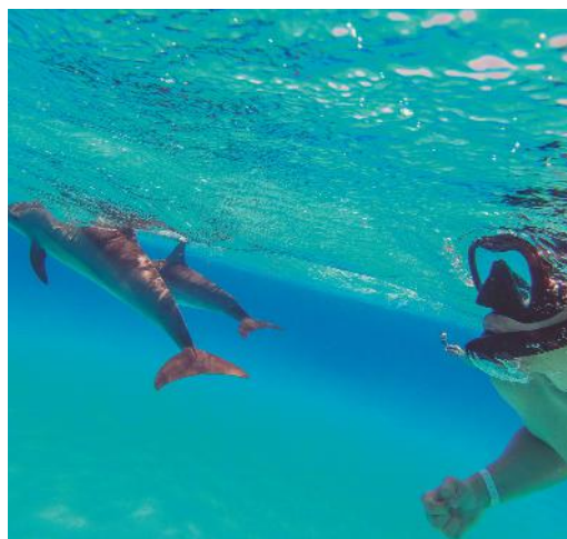
CLOCKWISE FROM TOP LEFT: Melote House, South Africa; Atzaró Okavango Camp, Botswana; swimming with dolphins; tracking a lion on a game drive

Couples can embark on guided nature walks that encourage connection with local people, set sail on water safaris along the rushing Palala river, or join a live veterinary experience such as ear notching to help track wildlife.