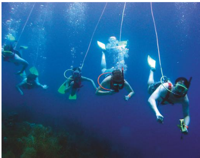
CLOCKWISE FROM LEFT: Yoga session, Stonefield Villa Resort; zipline, Morne Coubaril Historical Adventure Park; horse riding; and snuba diving