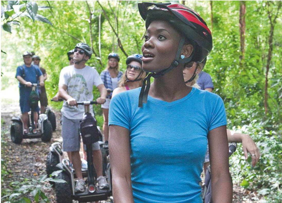
ABOVE: A Segway tour is an exhilarating way to explore Saint Lucia