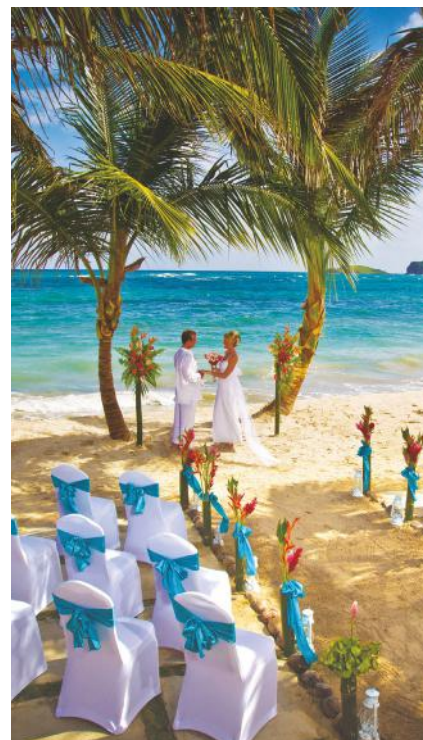
CLOCKWISE FROM ABOVE: Coconut Bay Beach Resort & Spa; view from the beach; wedding ceremony on the resort's Eternity Beach

is much easier, while a Covid travel insurance policy for around £30 for guests staying five nights or more covers medical or quarantine expenses in the event that Covid-19 disrupts a stay. Coconut Bay has also adopted a flexible approach to wedding bookings amid the pandemic. "We had one couple whose parents were elderly and didn't feel comfortable flying, so we've pushed their wedding date back," adds Natalia.