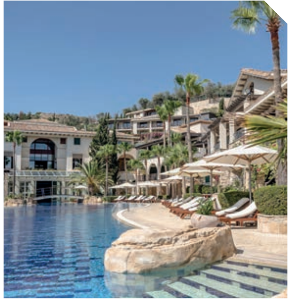
ABOVE: Columbia Beach Resort, Pissouri