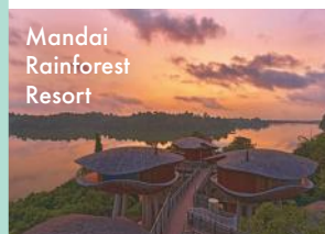
Mandai Rainforest Resort

"The new and unique Mandai Rainforest Resort by Banyan Tree is exciting me the most. Situated in the eastern part of Mandai Wildlife Reserve and overlooking Upper Seletar Reservoir, the 338-room resort's offerings include 24 elevated seedpod-shaped treehouses set among the trees. The concept of the resort is sympathetic to the existing vegetation and is designed to be unobtrusive, sitting below the upper canopy layer of the surrounding trees."