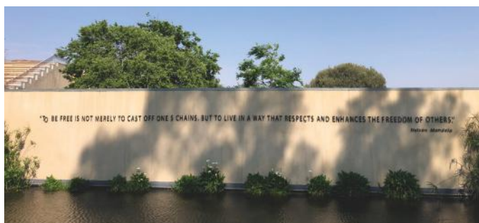
ABOVE: A grazing rhino; tuk-tuk tour in Soweto; Apartheid Museum, Johannesburg

for any Johannesburg itinerary, it's an incredibly moving (often uncomfortable) experience as it charts the country's apartheid years up to the first democratic elections. One of the most affecting areas is the political execution room, where 131 nooses hang from the ceiling as a memorial to those executed for opposing the government.