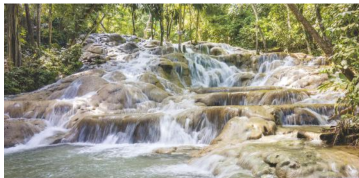
ABOVE: Dunn's River Falls FACING PAGE: Jerk-spiced chicken; arabica coffee beans

"The fam reinforced the idea that Jamaica offers diverse luxury experiences. Couples Sans Souci stood out with its adult-only atmosphere, but Half Moon was the real revelation – the turtle sanctuary makes it unforgettable for eco-conscious travellers, while the sprawling grounds and championship golf offer privacy that high-profile clients crave."