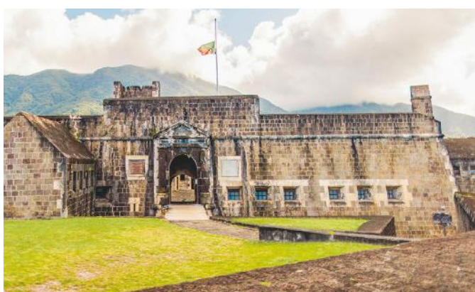
CLOCKWISE FROM LEFT: A beach bar in Frigate Bay; yachts; Brimstone Hill Fortress