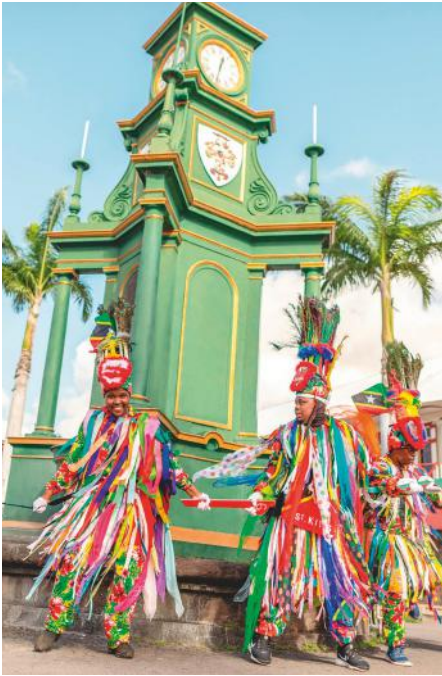
LEFT AND ABOVE: Palm trees on the beach; clocktower in capital Basseterre

tantalising tastes. Exploring the coffee and citrus farm, our guide Tiem explained that Liamuiga translates as 'fertile land' in the Indigenous language of the island, with an altitude of nearly 500m making the farm especially productive. He pointed out a coffee tree planted two years ago which was already producing pods.