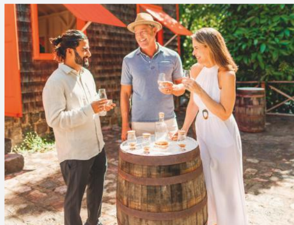
TOP: Yachts moored in St Kitts

Gold Medal offers seven nights' room-only at St Kitts Marriott Resort from £1,629 per person, based on two adults sharing a King Garden View Room. Includes BA flights from Gatwick, departing on October 7, plus transfers. goldmedal.co.uk The Kittitian RumMaster programme costs $150 (£118). stkittstourism.kn/stay-dine/joys-of-rum