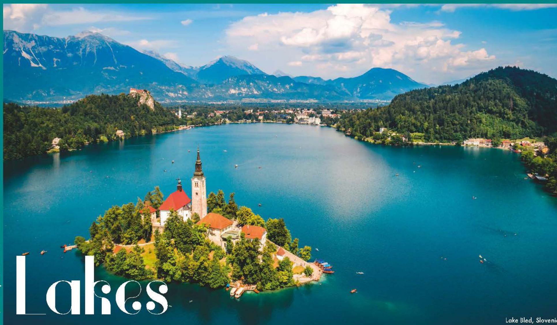
Lake Bled, Slovenia

There are also plenty of options for a fun and cultural city break. For clients who've done Lisbon, Berlin and Rome, new cities on the travel radar include Warsaw, Porto and Palermo. Here are some alternatives to the beach this summer.