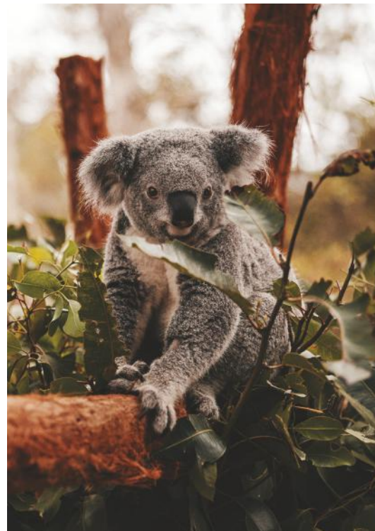
ABOVE: Hunter Valley; a koala at Taronga Zoo

who have performed at the Opera House, ranging from Bob Dylan to One Direction. To soak up the full experience, suggest clients book the Tour & Dine ticket (commissionable via Cultural Attractions of Australia), which includes lunch at the Opera Bar or House Canteen overlooking Sydney Harbour.