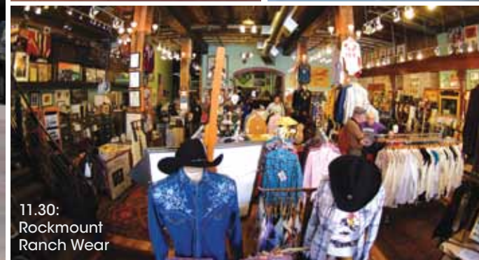
11.30: Rockmount Ranch Wear