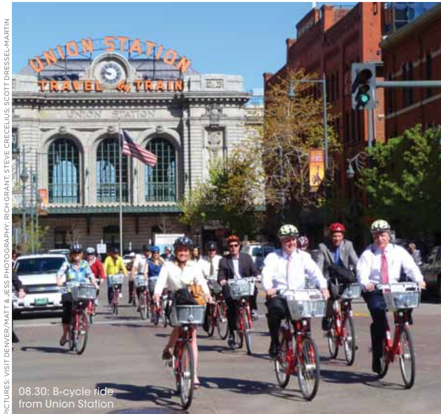
08.30: B-cycle ride from Union Station