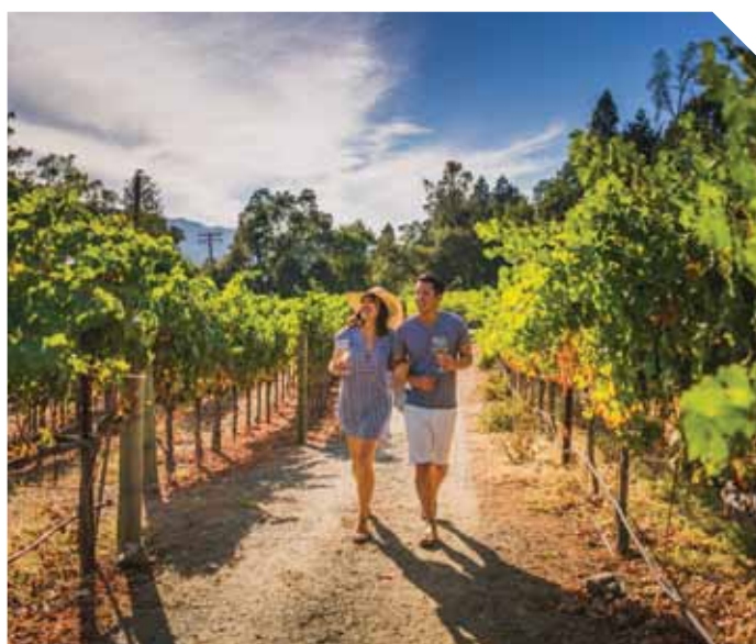
LEFT: Vineyards in Sonoma

Attraction World offers a Wine Country Full Day tour to Sonoma and Napa Valley, including hotel pick-up from San Francisco, tastings and a photo stop at the Golden Gate Bridge, from £86. attractionworld.com