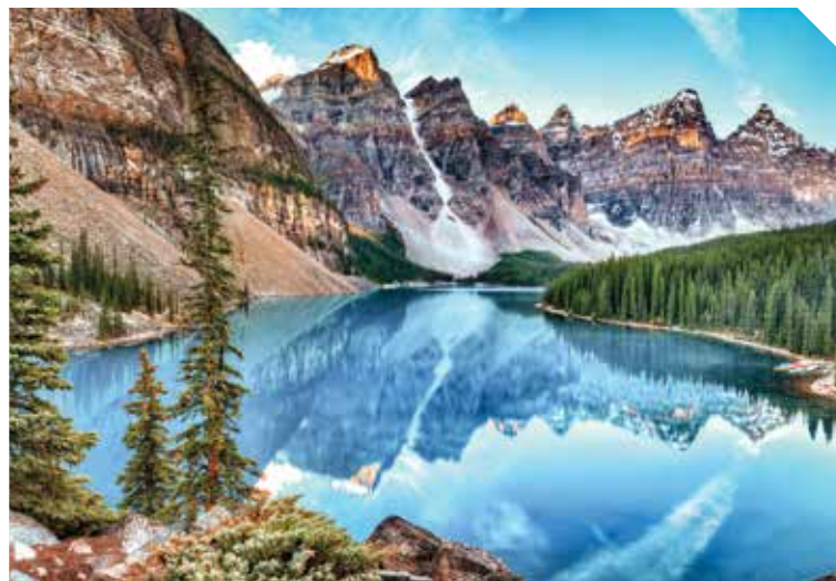
RIGHT: Banff National Park, Canada

the annual drinks and canapes networking event, and get your toes tapping with music from the various states.