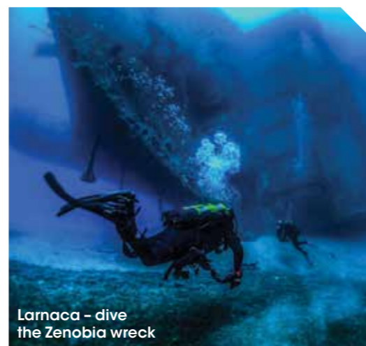
Larnaca - dive the Zenobia wreck