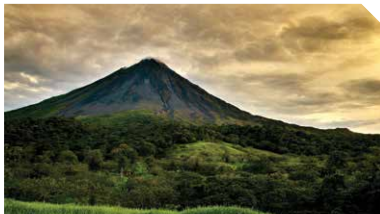
ABOVE: Arenal Volcano, Costa Rica

Costa Rica (LA200) is booming – UK arrivals were up 2.5% year