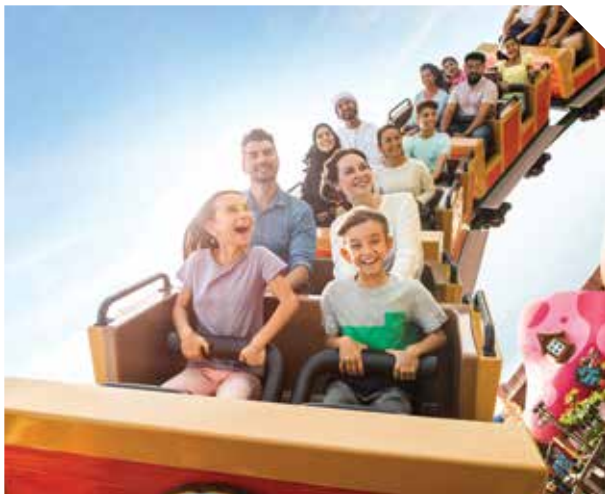
LEFT: Dubai Parks and Resorts