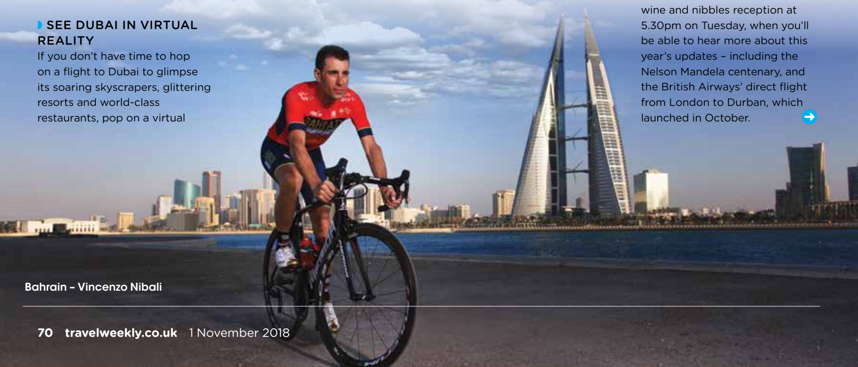
Bahrain – Vincenzo Nibali

There'll also be Facebook Live broadcasts from the stand providing tips and insider insight for agents selling the destination (10am-11am every day), and a wine and nibbles reception at 5.30pm on Tuesday, when you'll be able to hear more about this year's updates – including the Nelson Mandela centenary, and the British Airways' direct flight from London to Durban, which launched in October.