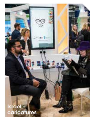
Israel - caricatures