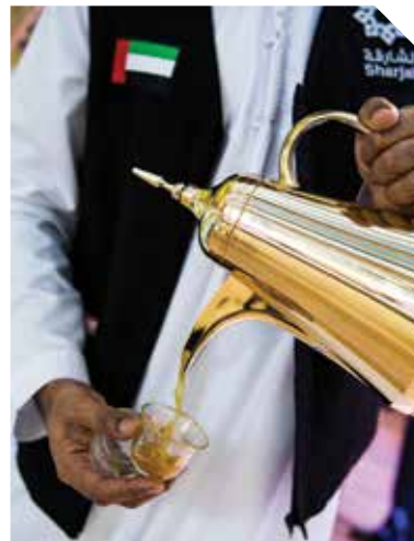
RIGHT: Sharjah – coffee