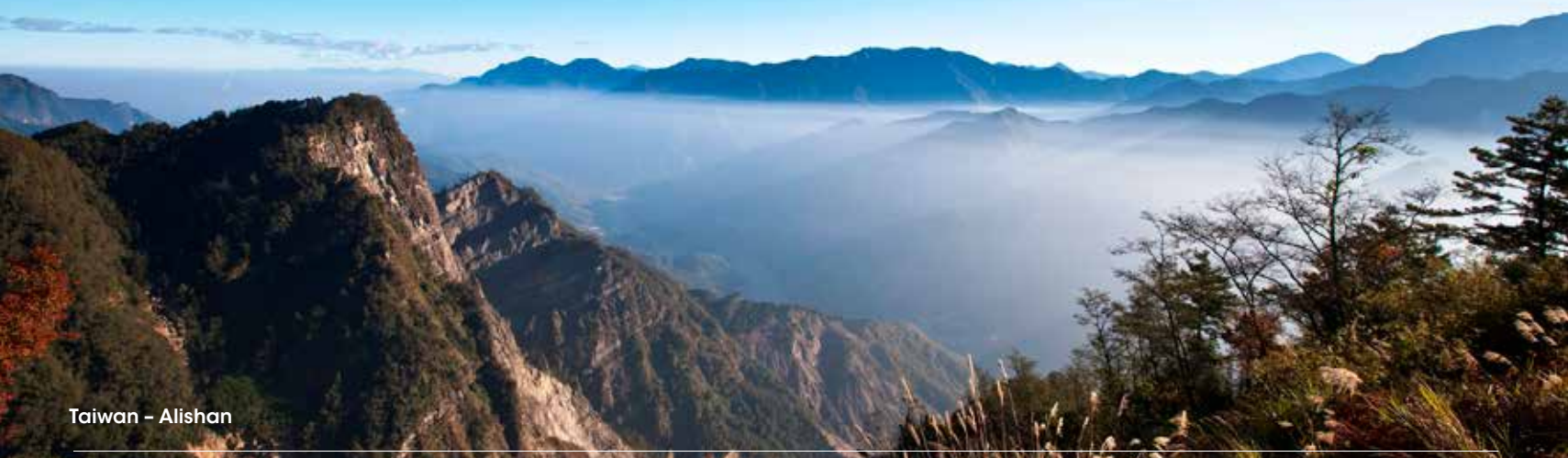
Taiwan – Alishan