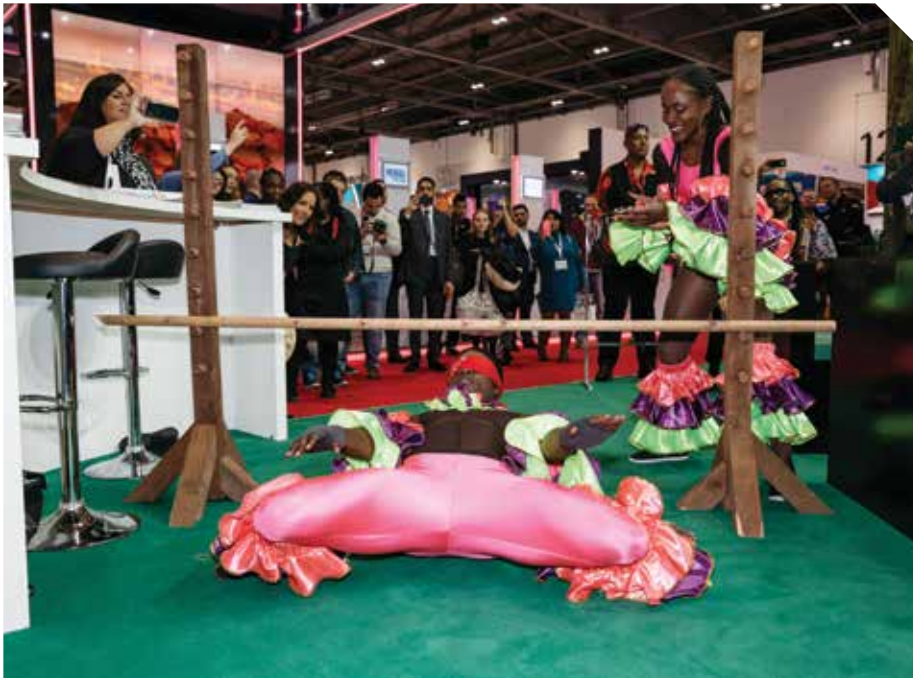
LEFT: Tobago – limbo dancing