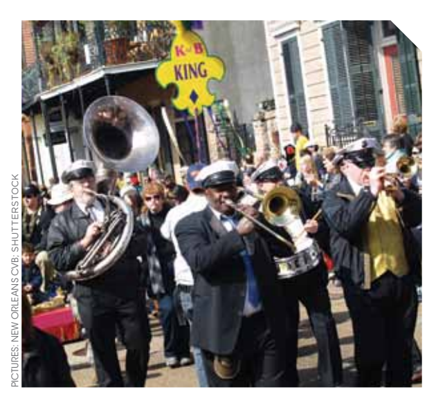
LEFT: New Orleans