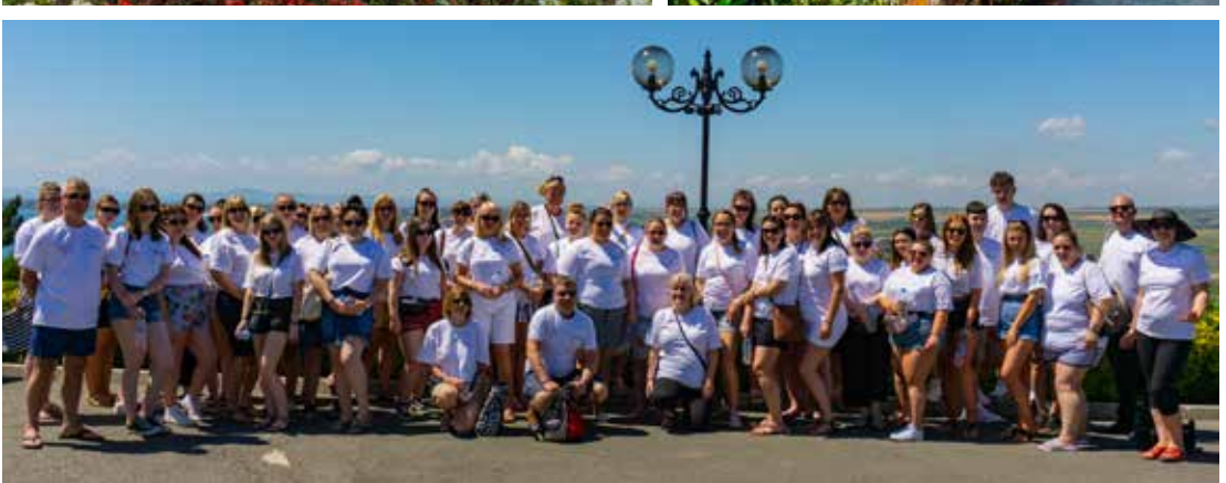
CLOCKWISE FROM TOP LEFT: Church of Christ Pantocrator; Nessebar; Sozopol; the fam group

the variety of restaurants, shops and attractions make it a popular destination for those looking for a great-value break.