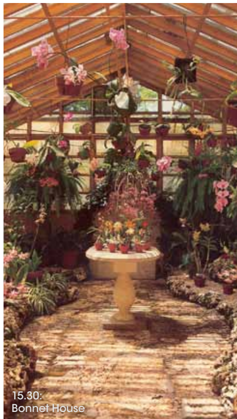
15.30: Bonnet House