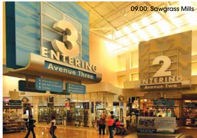
09.00: Sawgrass Mills