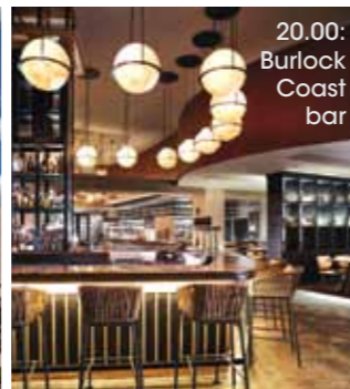
20.00: Burlock Coast bar