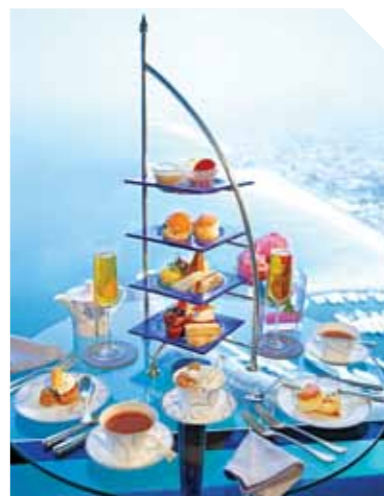
LEFT: Burj Al Arab, Dubai

6 MIAMI The city: "The lure of Miami is that it combines being a cosmopolitan city with a beachy lifestyle and great natural beauty," says Rebecca Evans, senior marketing executive at Funway Holidays. "It's a fab beachside city and perfect short-break destination as it's only eight hours away."