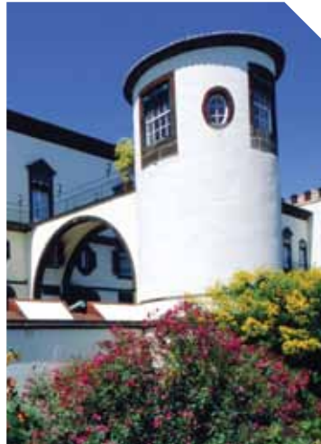
LEFT: Funchal, Madeira

9 FUNCHAL The city: The capital of Madeira has much to recommend it, offering a quieter kind of city break. Visitors can derive as much enjoyment from a stroll through its green spaces – the Botanical Gardens,