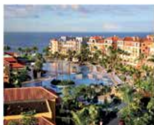
Sunlight Bahia Principe ***** sup Costa Adeje

At our hotels you can enjoy the comfort and quality of services of a Caribbean resort while still in Spain. Let yourself be swept away by this unique place with its lively culture and impressive landscape.