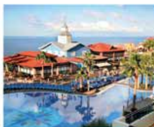
Sunlight Bahia Principe ***** sup Tenerife