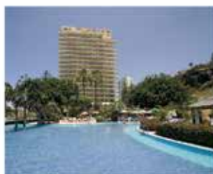
Sunlight Bahia Principe ***** sup San Felipe