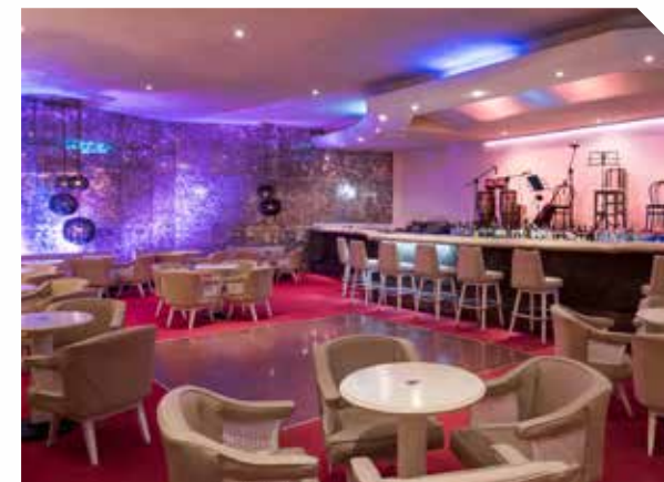
LEFT: Habana Riviera