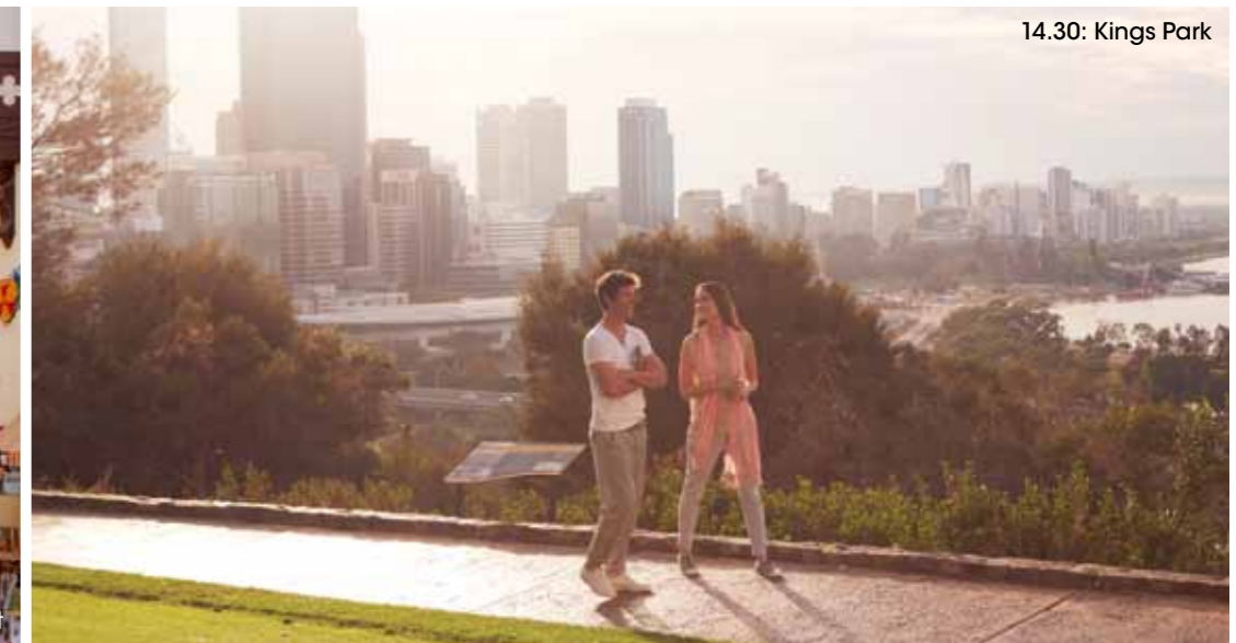
14.30: Kings Park

→ with blackberry gel to fried chicken on buttermilk pancakes. marystreetbakery.com.au