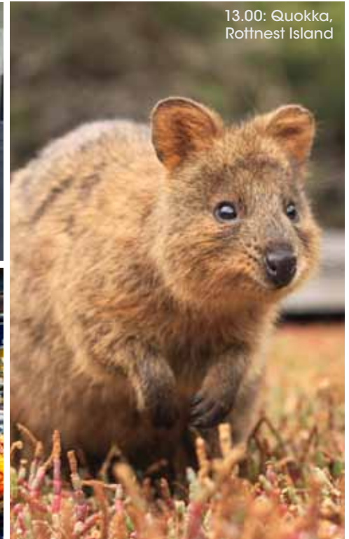
13.00: Quokka, Rottnest Island