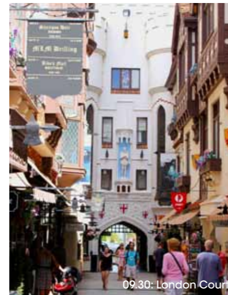
09.30: London Court