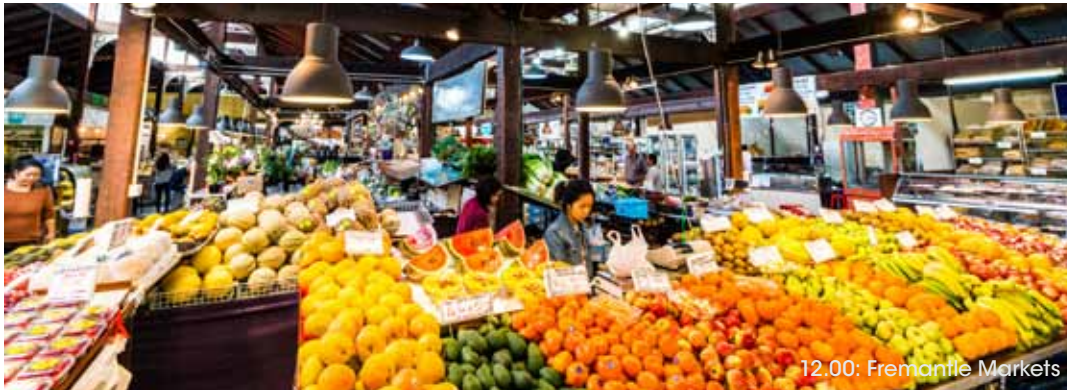
12.00: Fremantle Markets

➔ 19.00: See out the day with a meal at Il Lido Italian Canteen, a hugely popular restaurant just off the beach. Choose a private area or join the locals on a communal dining table, then take your pick from a seafood-heavy Italian menu and an enjoyably wide range of cocktails and wines. illido.com.au