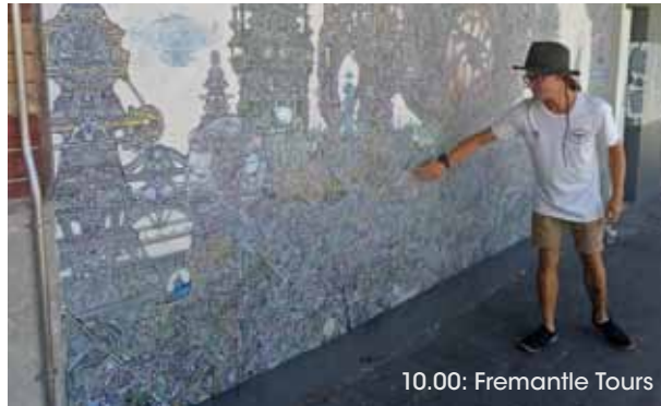
10.00: Fremantle Tours