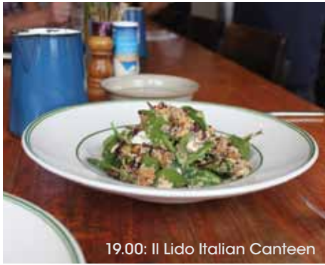
19.00: Il Lido Italian Canteen