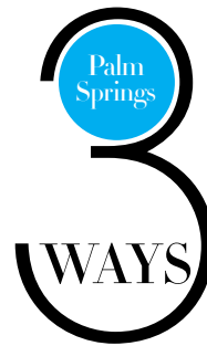
RIGHT: Palm Springs Visitors Center