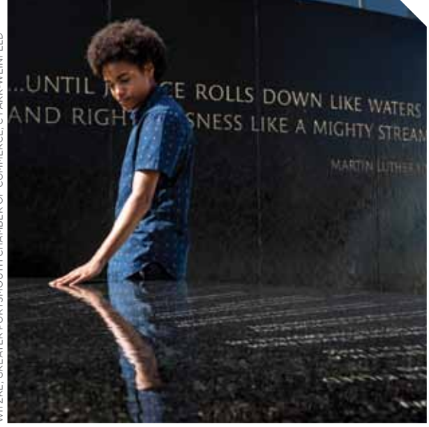
LEFT: Civil Rights Memorial Center. Alabama