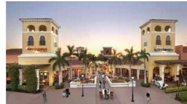
CLOCKWISE FROM LEFT: Cayo Costa; flying squirrel at the Clinic for the Rehabilitation of Wildlife; Miromar Outlets

PICTURES: The Lee County Visitor & Convention Bureau; The Beaches of Fort Myers and Sanibel