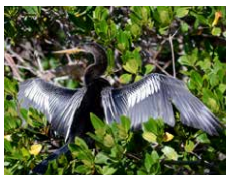
CLOCKWISE FROM TOP LEFT: Kayaking; Lovers Key State Park; an aninga at JN Ding Darling National Wildlife Refuge; dolphin in Pine Island Sound