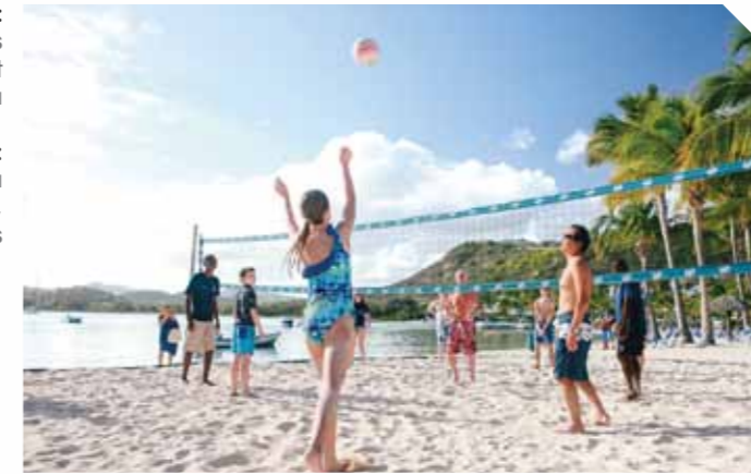
FAR RIGHT: Almyra Hotel, Cyprus