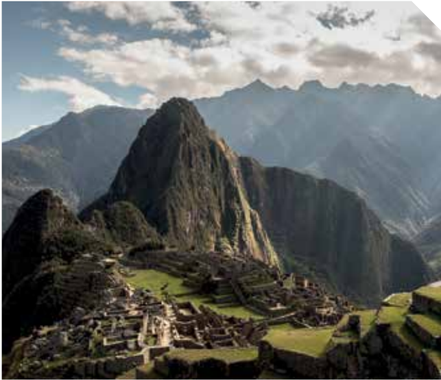
LEFT: Machu Picchu