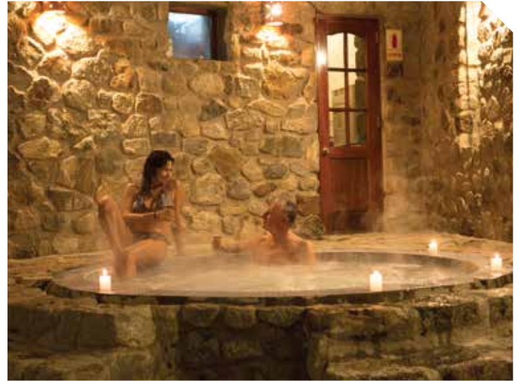
RIGHT: Wayra Lodge

→ As well as horse riding along the trail, cycling and zip-wires are options available in some sections. Cultural elements are also woven in; the drive from Cusco to the start of the trail includes stops at a women's craft cooperative, a colonial farmhouse and Inca ruins, and an organic farm.