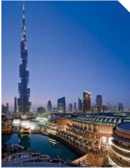
LEFT: Burj Khalifa