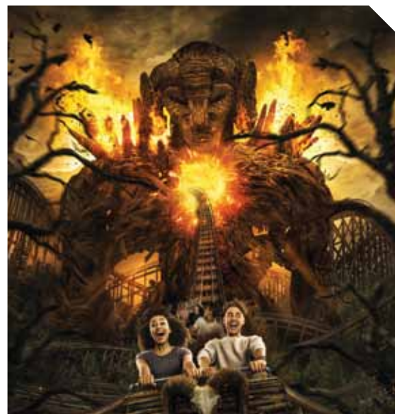
RIGHT: The Wicker Man ride at Alton Towers