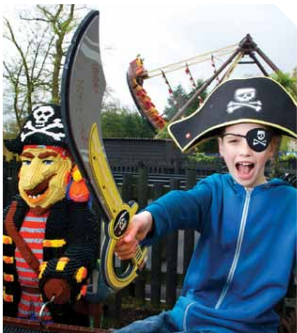
LEFT: Pirate Shores, Legoland Windsor