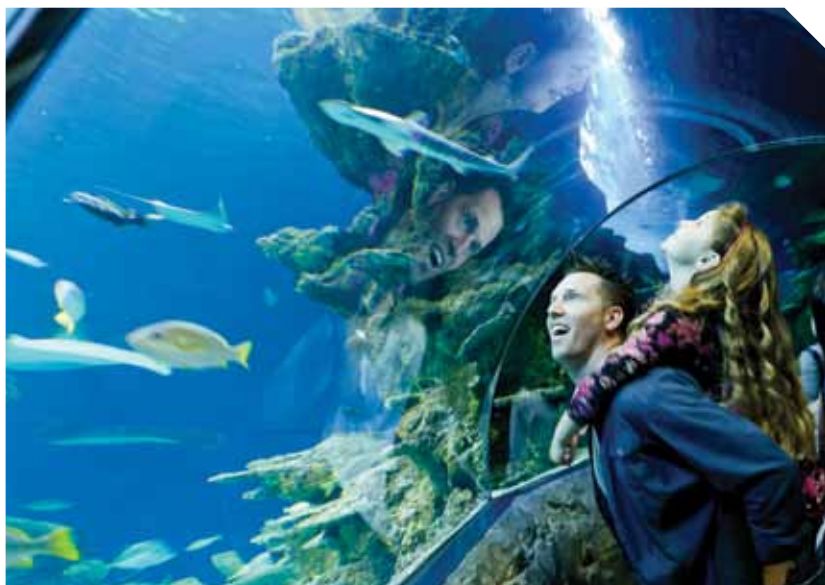
LEFT: Sea Life London Aquarium