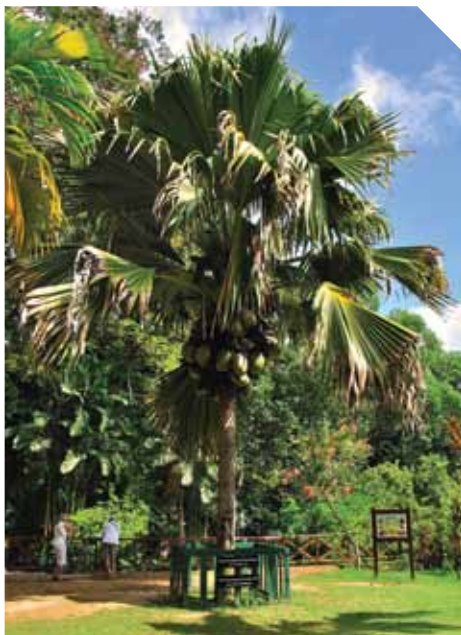
LEFT: Coco de mer tree, Vallée de Mai, Seychelles

"The ship had such a friendly, relaxed atmosphere, and the staff were amazing. The dining options were great too – from outdoor barbecues and buffet service to sit-down meals and alfresco dining at The Grill."