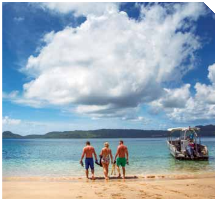
BELOW: Boudicca , Mayotte