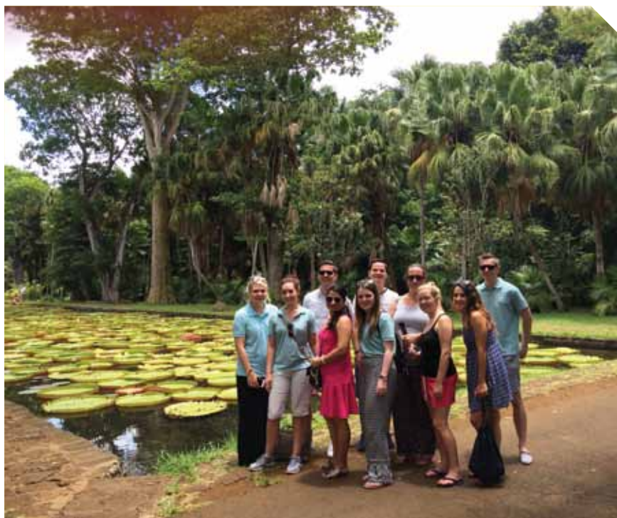
BELOW: Port Louis, Mauritius