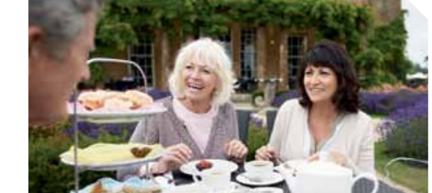
LEFT: Afternoon ted at Littlecote