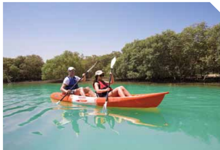
RIGHT: Kayaking in Mangrove National Park, Abu Dhabi

If that's not your client's idea of an adventure, how about spotting Arabian oryx, gazelles, giraffes, ostriches and even cheetahs amid a 1,400-hectare wildlife park? Sir Bani Yas Island's Arabian Wildlife Park offers game-viewing drives plus horse-riding, hiking and more.