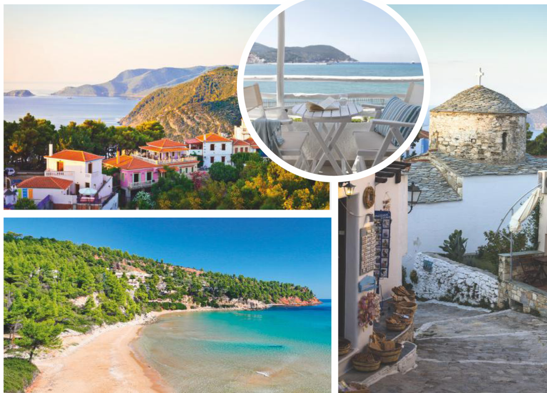
CLOCKWISE FROM TOP LEFT: Alonissos; Skopelos Village Hotel; stone houses; Chrissi Millia beach

Olympic Holidays offers 10 nights' island-hopping from £1,399 per person, including return flights from Gatwick, transfers and ferries. It includes three nights each at Mandraki Village Boutique Hotel in Skiathos, Skopelos Village Hotel and 4 Epoches Alonissos Hotel, and one night at Bourtzi Hotel, Skiathos. Price based on two adults sharing. olympicholidays.com