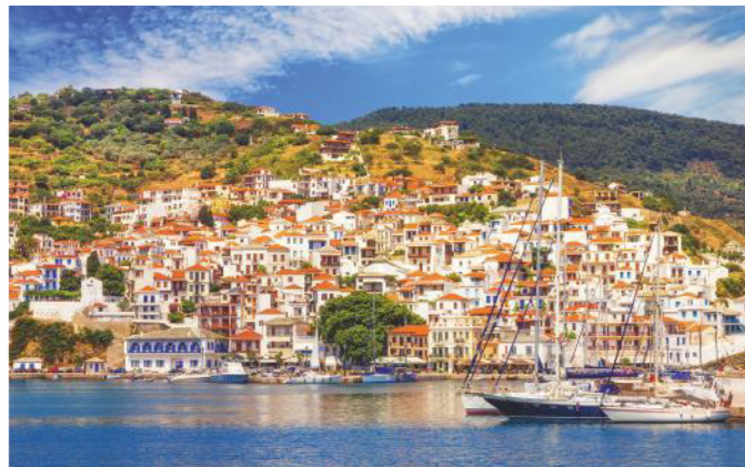
CLOCKWISE FROM LEFT: Skopelos Old Town; Koukounaries beach, Skiathos; Atrium Hotel, Skiathos

Ultra-luxe and secluded, with two private beaches, this large hotel has a lot of steps so is best for very fit clients.