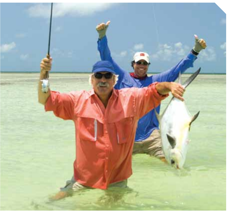
ABOVE: Sea fishing

The tropical string of islands is easily accessible from Miami via the Overseas Highway, which runs from Key Largo to Key West. Spanning 113 miles and featuring 42 bridges, this 'magic carpet' enables visitors to cross the Keys in about four hours.