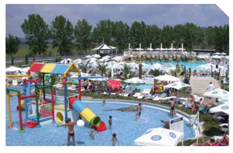
ABOVE: Sunny Beach, Bulgaria

For a bargain break closer to home, look to the UK's holiday parks. They offer accommodation types to suit a range of budgets, from coast-side caravans to luxury lodges, alongside comprehensive activity programmes that will keep kids entertained while parents slot in some down-time.