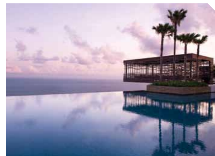
LEFT: Alila Villas Uluwatu, Bali