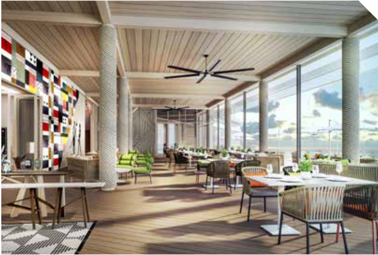
LEFT: Hard Rock Hotel Maldives