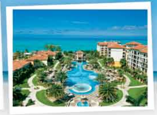
BEACHES TURKS & CAICOS RESORT VILLAGES & SPA, TURKS & CAICOS