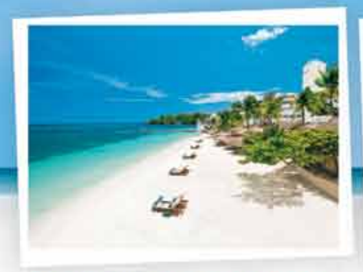
BEACHES OCHO RIOS — A SPA, GOLF & WATERPARK RESORT, JAMAICA

Tipping, transfers & government taxes included