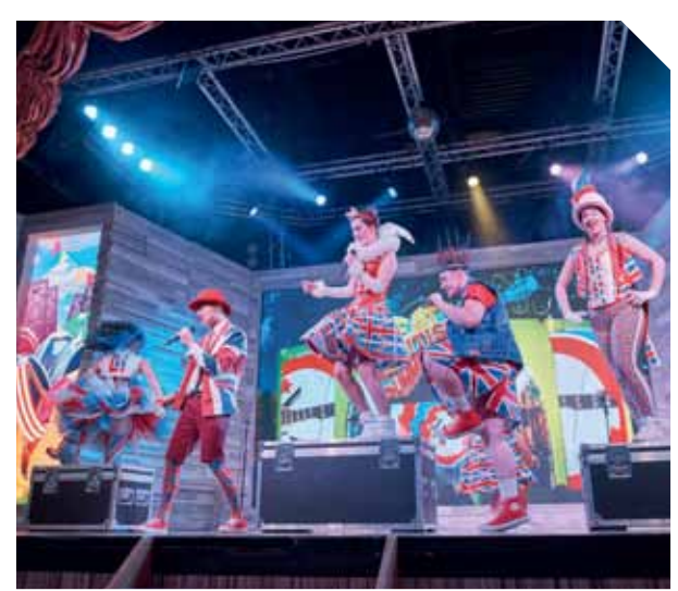
RIGHT: The Great British Summertime show