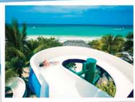
BEACHES NEGRIL RESORT & SPA, JAMAICA