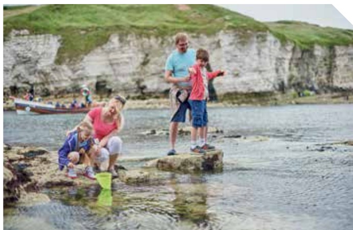
LEFT: North Landing, Yorkshire

Segway rides, and the Nature Rockz programme, in which expert rangers teach kids about bushcraft, animal tracking and local wildlife.