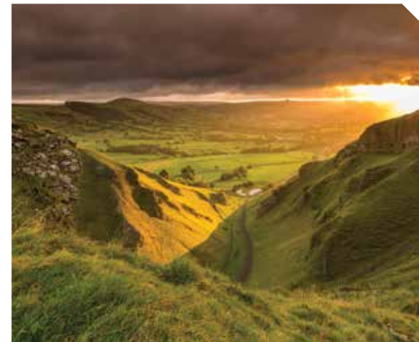
LEFT: Winnats Pass, Peak District

Sections of the cave, known as Fairyland, Aladdin's Cave and the Witch's Cave, indicate the magical sights that greet visitors in this chilly underworld.