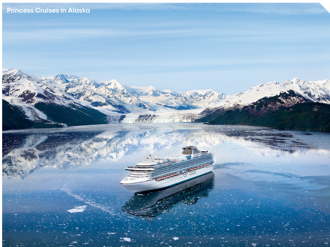
Princess Cruises in Alaska