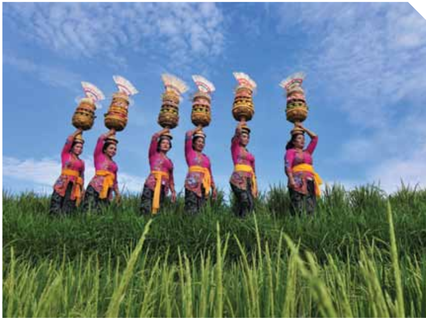
BELOW: Royal Ambarrukmo Yogyakarta