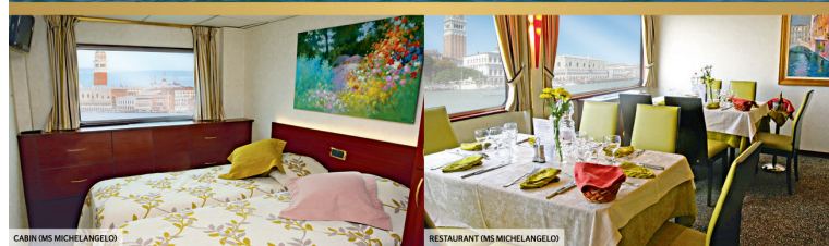
CABIN (MS MICHELANGELO)