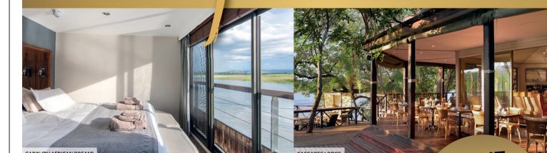
CABIN (RV AFRICAN DREAM)

SOUTH AFRICA • BOTSWANA • NAMIBIA • ZIMBABWE