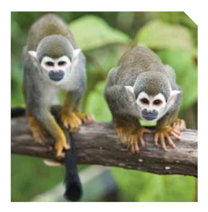
LEFT: Squirrel monkeys Costa Rica