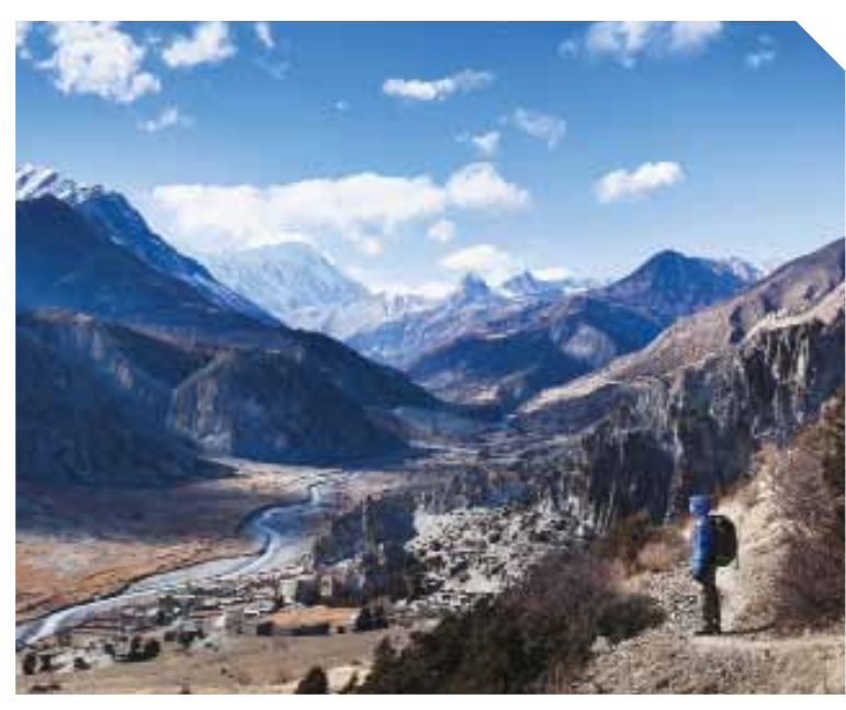
RIGHT: Trekking in Annapurna, Nepal

Saga's Vancouver & the Rockies trip packs in the highlights in a 15-night expedition visiting Banff, Lake Louise, Calgary and beyond, throwing in a scenic drive along the Icefields Parkway, a tour of Jasper's Maligne Canyon and a ride on the Ice Explorer to top it all off. Book it: From £4,299 departing September 20, including accommodation, transport, some meals, porterage, flights, and a VIP door-to-door travel service. travel.saga.co.uk