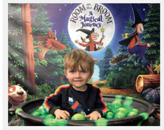
FROM TOP: The dragon; Dexter in the witch's cauldron, where she casts her spell to make a 'truly magnificent' broom

BOOK IT Attraction World offers Chessington Theme Park & Zoo half-day tickets (after 12pm) from £30 per adult or child. attractionworld.com