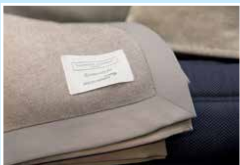
BA: The White Company bedding

British Airways has been rolling out luxurious bedding from The White Company in its business-class cabins throughout 2018. batrainingacademy.com