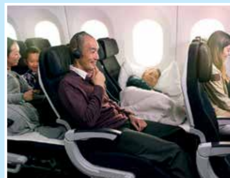
AIR NEW ZEALAND: Economy Skycouch

that can be transformed into a comfy couch after takeoff, complete with bedding and pillows. Later this year, the Skycouch Infant Harness and Belt will be introduced to all Air New Zealand 777 and 787-9 long-haul services, allowing infants to stay lying down throughout the cruise phase of flight, even when the seatbelt sign is on. airnzagent.co.uk