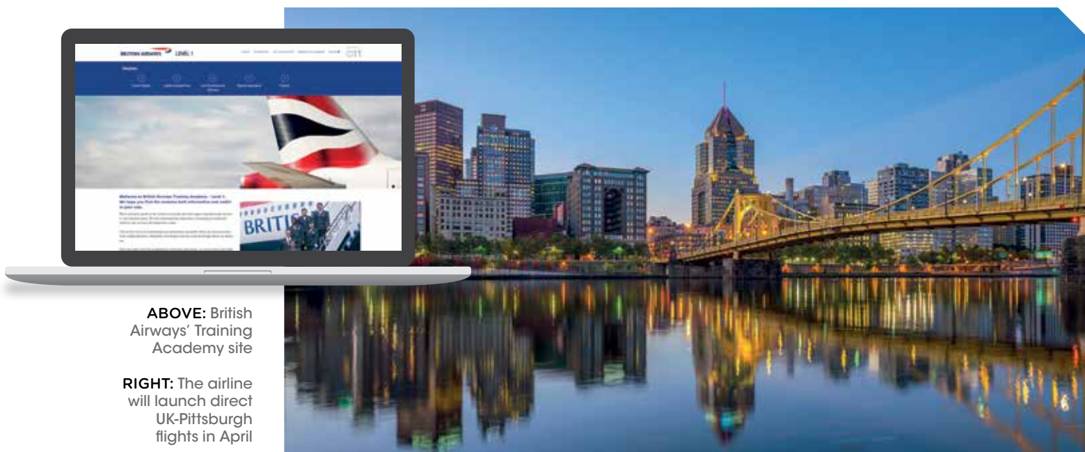
ABOVE: British Airways' Training Academy site