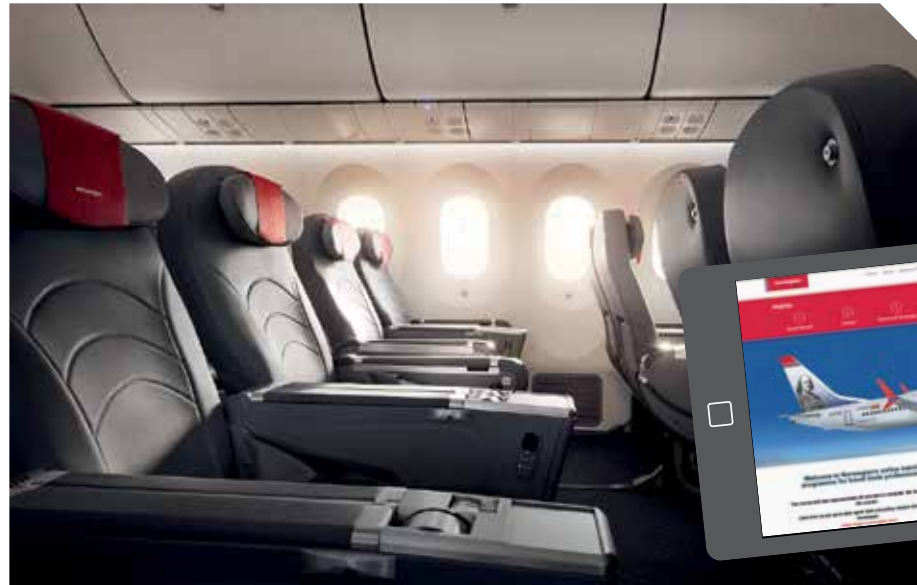
LEFT: Norwegian's Premium cabin

Brush up on the German carrier's product information and amass booking tips via the airline group's online travel agent