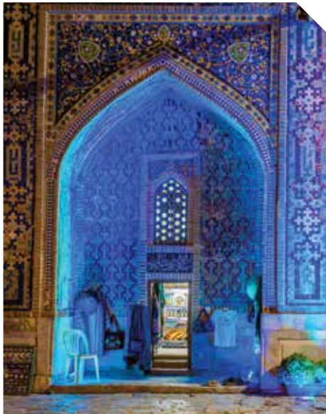
LEFT: Samarkand, Uzbekistan

We've seen a spike in interest for the wider central Asia region recently, and in May, we launched our first tour to Armenia and Georgia, which has gone down a storm. We find the initial pull for clients is the ancient culture and history surrounding the Silk Road. Uzbekistan's shimmering cities such as Samarkand and Khiva are a major attraction, but there's so much more. The people in these regions are welcoming beyond belief. When I was in Armenia recently, I was invited into a family's home, and their hospitality just shone through. The food and drink also has a real honesty about it; there's an abundance of fresh produce and you can pick apricots, peaches, cherries and other fruit fresh from the trees almost everywhere you go. Central Asia is still in its infancy in receiving modern tourists, and as such, it's relatively unspoilt. It always delivers so much more than I expect it to.