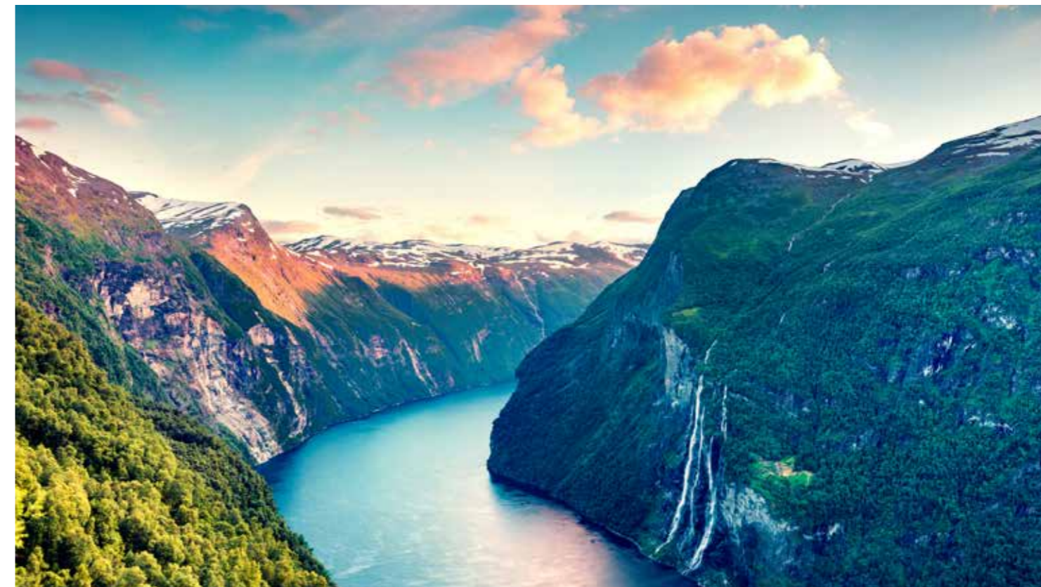
ABOVE: Norwegian fjords (May and June) FACING PAGE: Christie Brinkley, godmother of Regent Seven Seas Cruises' Seven Seas Splendor (February); American Queen Steamboat Company's American Countess (May); suite on Uniworld's Sao Gabriel (March)

What's new? Riviera Travel continues its literary launches with the new 176-passenger river ship Geoffrey Chaucer .